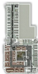
Příklad dalších podlaží